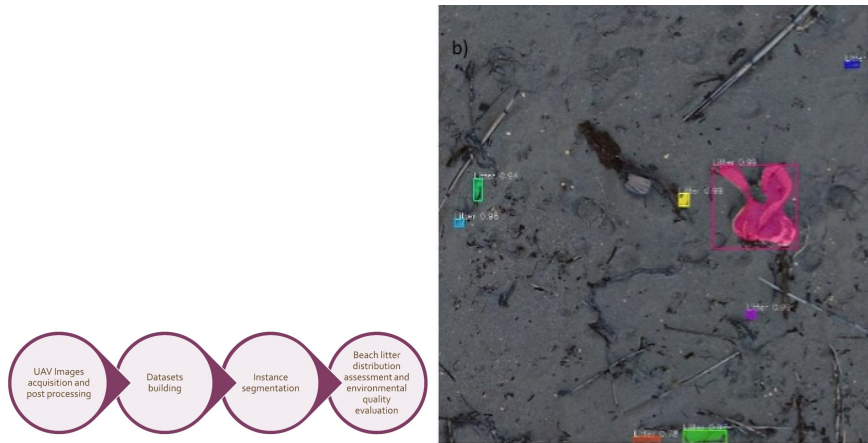
Figure 1: System workflow (left) and Litter recognition examples (right).

Raspberry PI) containing the object recognition module. The limited computational capacity of the hardware and the need for real-time response imply the design of a model that optimizes and reduces computational and memory requirements.